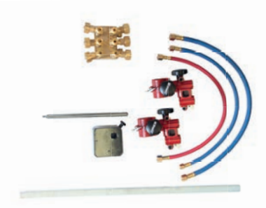
0870616 Extension kit for 2-torches