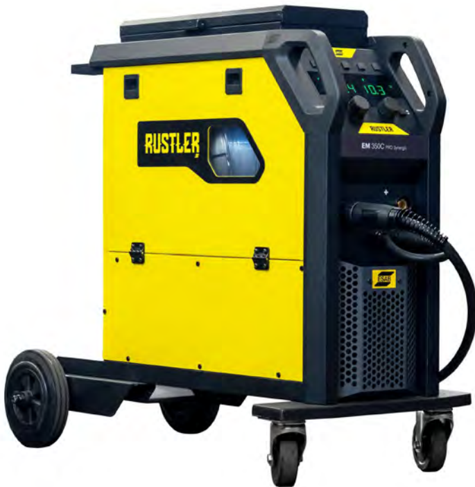
Rustler EM 350C PRO Synergic

Rustler MIG PRO compact welding inverters are your solution of choice for the most common welding challenges. Equipped with the latest inverter technology, they combine low energy consumption with optimized welding performance.