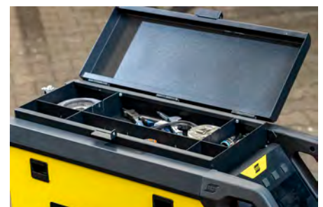
Optional top toolbox for accessories