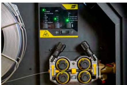
Best in class wire feeding mechanism